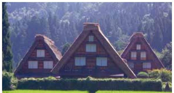
The World Heritage Site Shirakawa-go

The number of Chinese tourists is the largest among overnight visitors from other countries accounting for 24.5% of the total, followed by Taiwan (22.1%) and Thailand (13.8%).