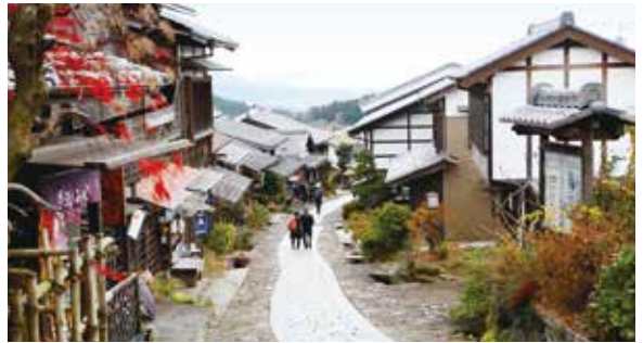
Magome-juku, an old post town on the Nakasendo road

Gifu Prefecture is endowed with a beautiful natural environment represented by magnificent mountains, pristine streams and traditional culture, all of which have long been cherished by the local residents. A large number of people visit Gifu to experience a wide range of these great features. In 2020, tourists visiting roadside stations and other rest areas accounted for the highest proportion of tourists visiting Gifu Prefecture among all destination types, followed by sports and recreation, historical and cultural destinations, urban tourism (shopping and cuisine), hot springs and health promotion, and natural attractions.