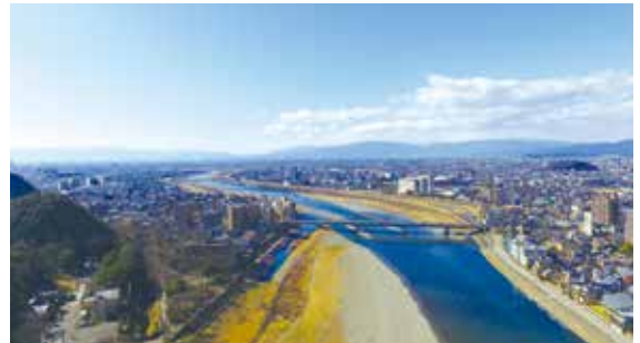
The Nagara River flowing through the Nobi Plain

Gifu is situated approximately in the center of the Japanese archipelago, occupying a total land area of approximately 10,621 square kilometers, or 2.8% of Japan's total landmass. Of this area, approximately one quarter is made up of highlands, which exceeds 1,000 meters above sea level. Gifu has a rich natural environment, with 80.7% of the prefecture covered by woods and forests. The northern and eastern parts are mountainous and the Nobi Plain expands across the southern part, where beautiful rivers flow, converging in the riverside area at sea level.