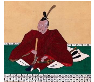
Portrait of Inaba Masanari (held by Gifu Prefectural Museum)

In 1600, Sekigahara, in Mino, became the stage for the fateful Battle of Sekigahara. Although this battle took place over the course of just one day, it was to be the largest determinant of the direction of Japanese history