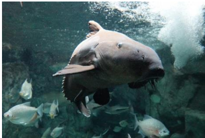
The oxydoras, which inhabits the Amazon River basin

Catfish and their relatives account for 10% of all different species of fish. Our upcoming catfish exhibition will feature about 50