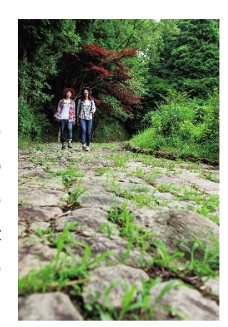
Cobbled Paths of Utōzaka, National Historic Site (Mitake area, Nakasendō)

During the next two months, Nakasendō the and surrounding area within Gifu Prefecture will play host to "Walk the 17 Nakasendō stations of Gifu 2017". Those visit ancient who the "highway through the mountains" during this period will have over 100 different activities to choose