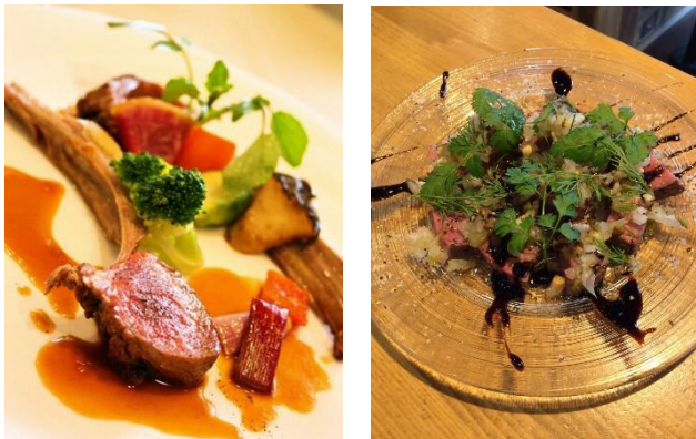
Dishes such as these will be showcased at the fair

Gifu's wild boar and deer are promoted by the prefecture as "forest delicacies". In February, the "Forest Delicacies Fair 2018" will be held at various restaurants in and outside the prefecture, showcasing dishes which use Gifu's wild boar and deer. Come along and have a taste of Gifu's winter flavors.