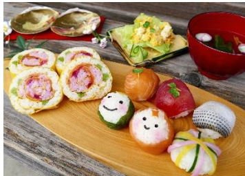
Mitake hanazushi and temarizushi

Explore the prefecture via Gifu's Nakasendo with our walking programs. Within Gifu Prefecture, the Nakasendo stretches across 126.5km and 17 stations. The theme for this season is "flowers and sake", with programs offering experiences which can only be enjoyed at this time of year, such as making mitake hanazushi and trying local sake.